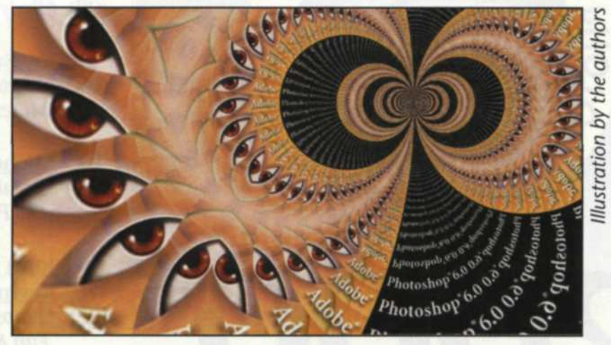
Adobe Photoshop 6.0

Photographers working in the digital world today must have a versatile and reliable editing program. It needs to cover a broad spectrum of editing situations and provide more tools than you'll ever need. For over 10 years, Adobe Photoshop has been working to become the industry standard in photo editing programs. This program is one of the most powerful photo editing programs ever made. It features all the necessary controls for color, contrast, gamma, sharpness, retouching, special effects, printing output, text overlay, composite images, and so much more.