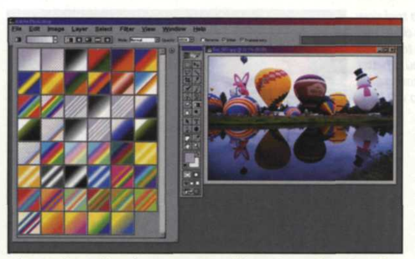
The gradient palette has some very striking color combinations that can be edited to your own specifications.

The custom shapes palette has dozens of basic shapes that can be changed and modified with special tools in the toolbox.