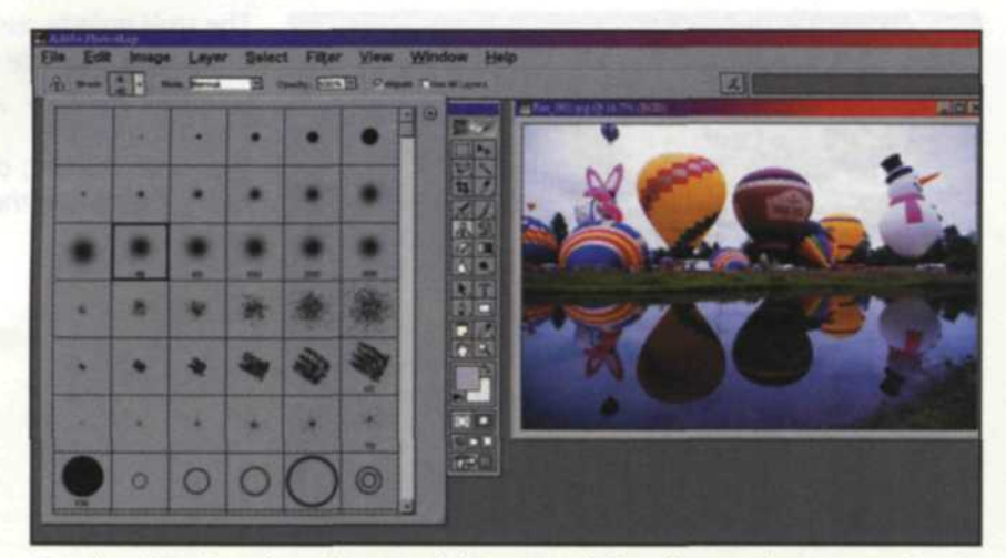
The brush palette has dozens of shapes and sizes for maximum creative effect when editing.